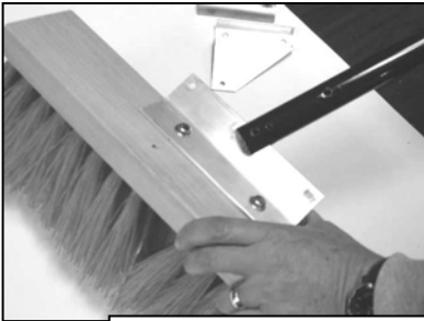
Shown with aluminum handle